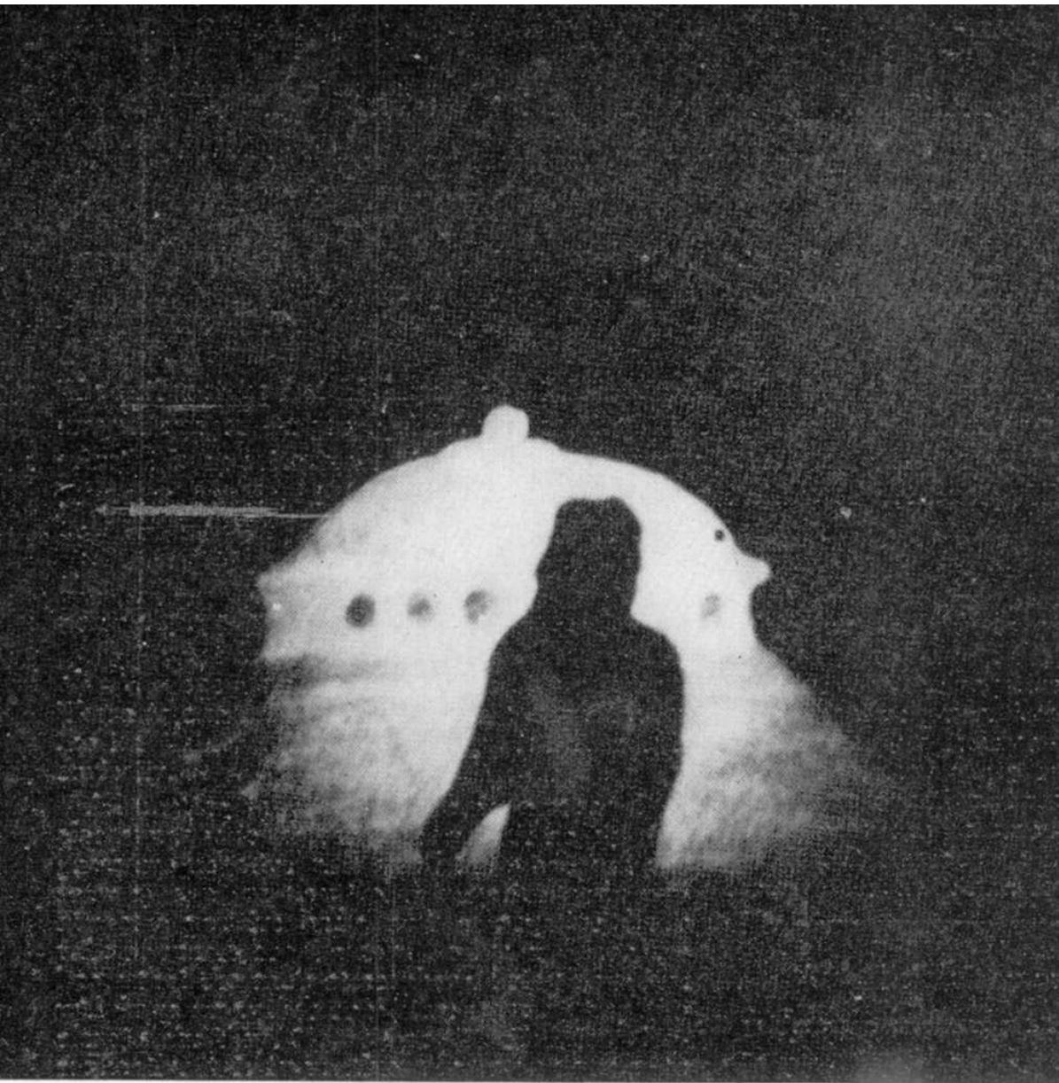
One of the Venusians is here seen returning to his craft. This man had long golden hair, like the man described by Adamski in his first contact. The only light used in taking this picture was that emanating from the ship. Photo taken by Menger with a Polaroid camera, which develops picture while it is still in camera. Pictures removed from camera in presence of witnesses. Photo : Courtesy Howard Menger and G. W. Van Tassel.

with a dense atmosphere around it. No land definitions or bodies of water appeared from that distance. The projection of life there, shown to me in the ship, was a few feet to a few hundred feet above their planet. Describing the inside of the ship which I was in would take more time than this tape recording will allow. 1 Generally, the lighting appeared to come from the walls. I was very comfortable. There were beautiful, coloured panels and buttons similar to an electric organ on one section of the wall and floor. Very comfortable chairs would pop up or disappear with a wave of a hand or the touch of a button.