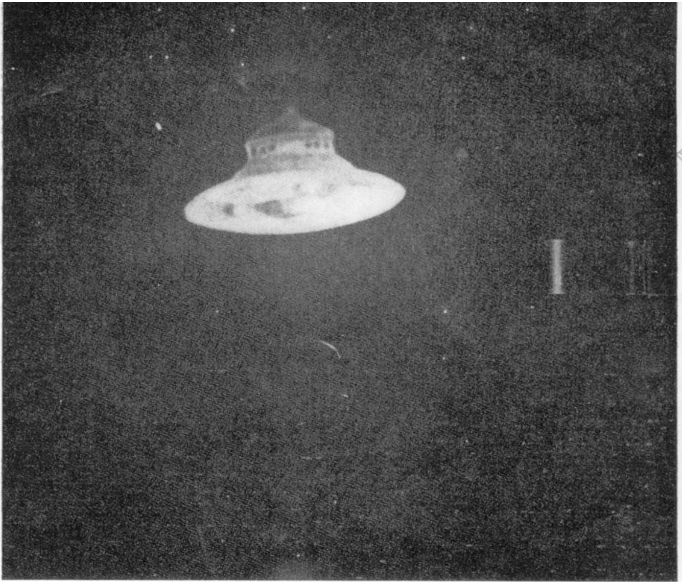
This picture shows a saucer approaching the spot where Menger met the space visitors.